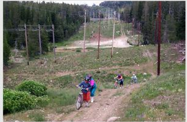
The big hill